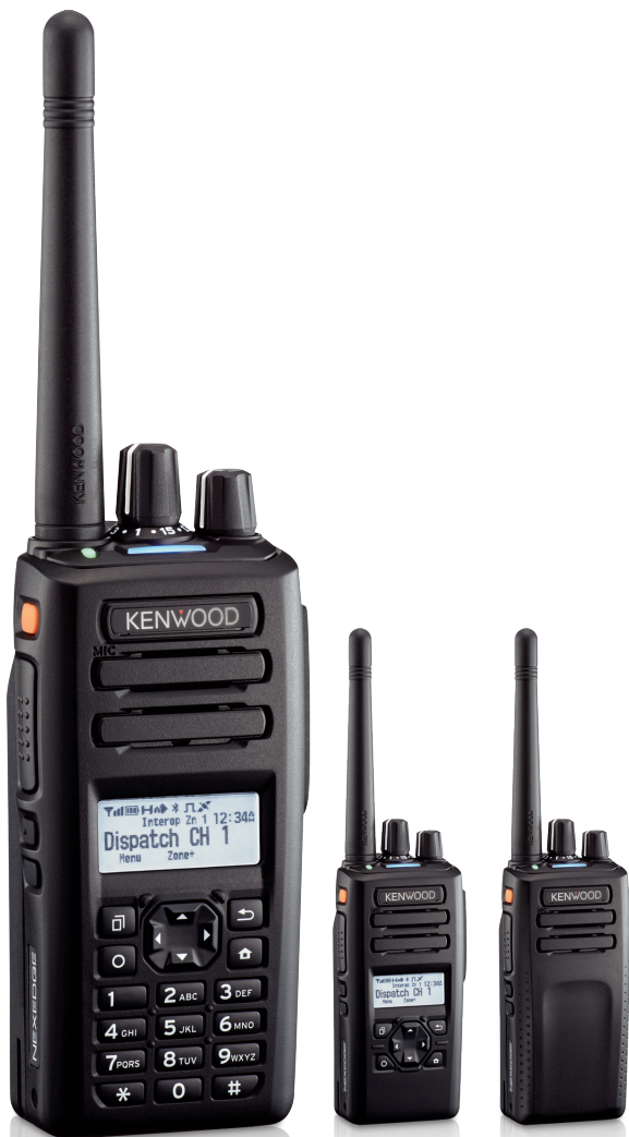
Full Keypad Model