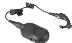
Operations Critical Wireless Earpiece

“When I first saw the MOTOTRBO SL Series I thought that it was a cell phone, not an actual two-way radio. It has all the capabilities of a two-way radio but with a professional, discreet look that fits absolutely well with all our uniforms.”